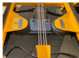
Spring & airbag suspension