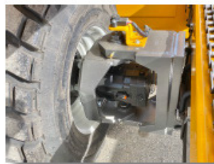
VARIOSTEER multi steer options